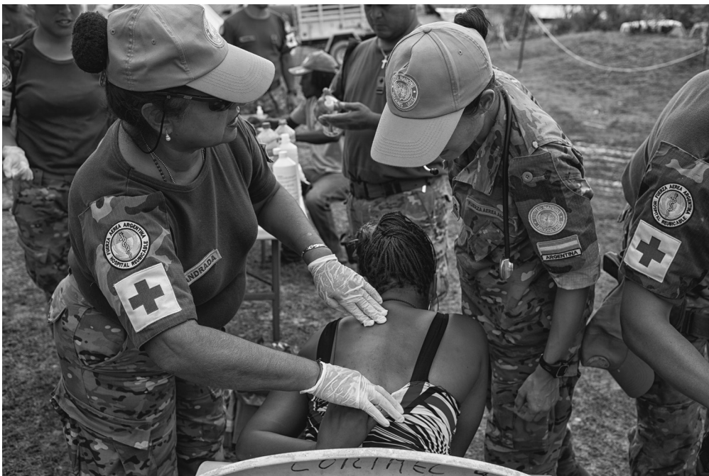
Argentinean peacekeepers with the United Nations Mission in Haiti (MINUSTAH) administer medical aid to residents of Les Cayes affected by Hurricane Matthew in 2016.

*Find a real-life example of a place where the UN has helped to ensure human rights are respected by visiting: http://www.ohchr.org/EN/Countries/Pages/WorkInField.aspx