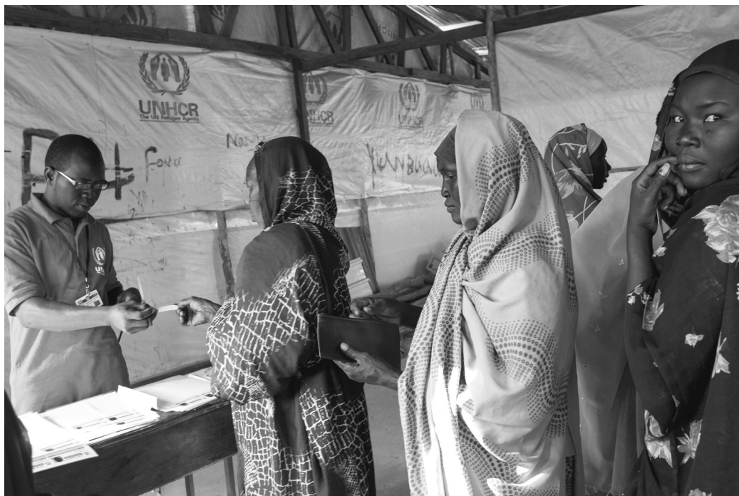
A UNHCR (UN Refugee Agency) registration officer issues identification cards to refugees at the refugee camp in Nyeel, South Sudan in 2013.

*Go to http://www.un.org/en/sections/issues-depth/global-issues-overview/ to see a full list of issues. Choose one that interests you and click on its link. Why is the UN involved? In what ways is it trying to help? What countries are especially involved in the issue? How can you help too?