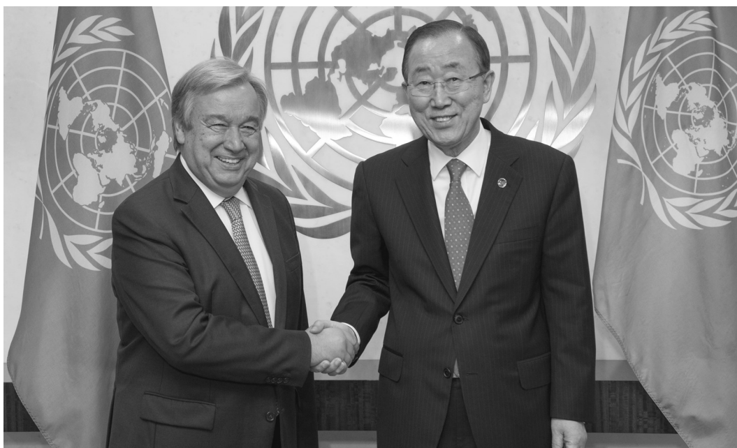
Former Secretary-General Ban Ki-moon from South Korea (right) meets with António Guterres from Portugal, the current Secretary-General as of 2017. In 2016, the General Assembly appointed Mr. Guterres by acclamation, to serve as the next Secretary-General of the United Nations.

How can you be the next Secretary General? The Secretary-General is appointed by the General Assembly on the recommendation of the Security Council for a five-year, renewable term. Although there is no written rule, the role of Secretary-General is rotated among the various regions of the world.